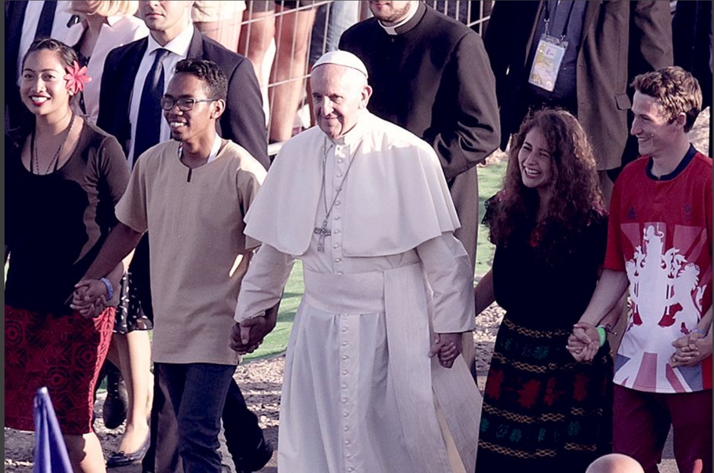
Pope Francis at World Youth Day in Poland, 2016.

~ Pope Francis, Evangelii Gaudium (2013), no. 24